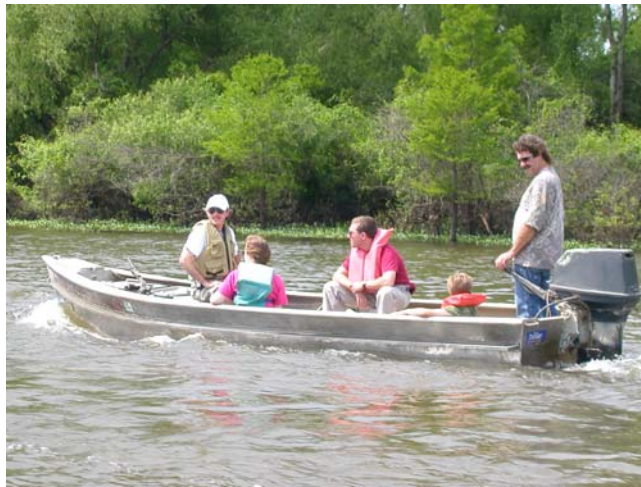
Clinic attorneys, students, and clients touring the bayous of Louisiana.

The Water Quality Protection Initiative addresses water pollution problems in Louisiana by enabling citizens to pressure the responsible government agencies to protect water resources and to enforce the Clean Water Act directly against polluters. The Water Quality Protection Initiative's goals are to reform the state water protection program, to abate harmful water discharges, and to empower citizens to participate effectively in the permitting and enforcement process. Part of this work includes serving as legal counsel on LEAN's Lower Mississippi Riverkeeper project, part of Robert F. Kennedy's national Waterkeeper Alliance. The Clinic worked on the following matters during the 2003 - 2004 school year: