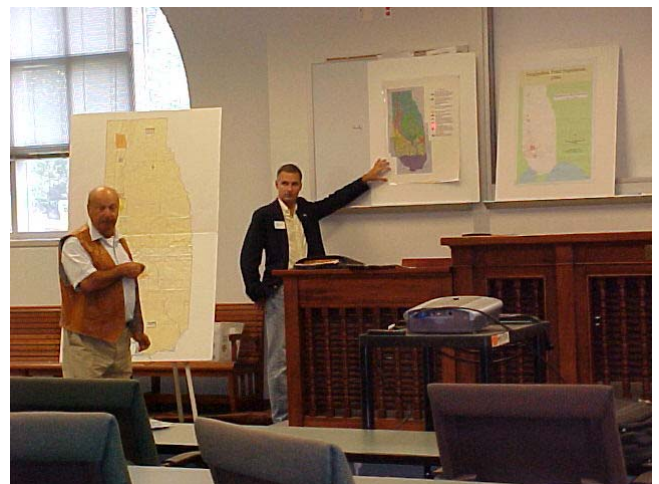
Southern Forests Conference at Tulane