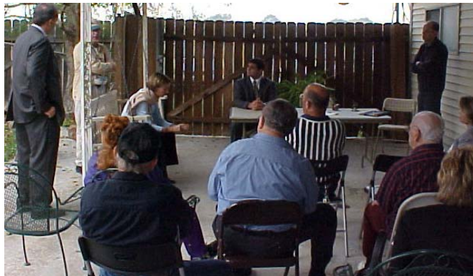
Chalmette Press Conference