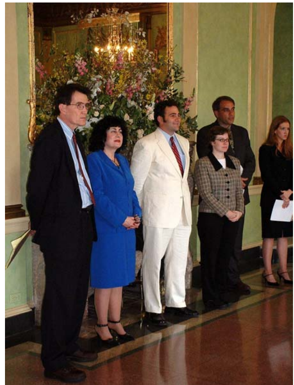
Press Conference about Mansfield Battlefield at Old Governor’s Mansion.