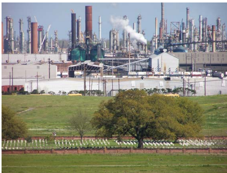
Refinery near a cemetery in Chalmette, Louisiana.

On behalf of and in consultation with the Clinic's clients, the Clean Air Initiative targets toxic air pollution in Louisiana from industrial facilities, including oil refineries and chemical and petrochemical manufacturing facilities, which are overwhelmingly concentrated in low-income, minority communities throughout Louisiana. The Initiative's goals are to abate dangerous air emissions, deter industry violations of the Clean Air Act, and empower citizens to participate effectively in the permitting and enforcement process. The Clinic worked on the following clean air matters during the 2003 - 2004 school year: